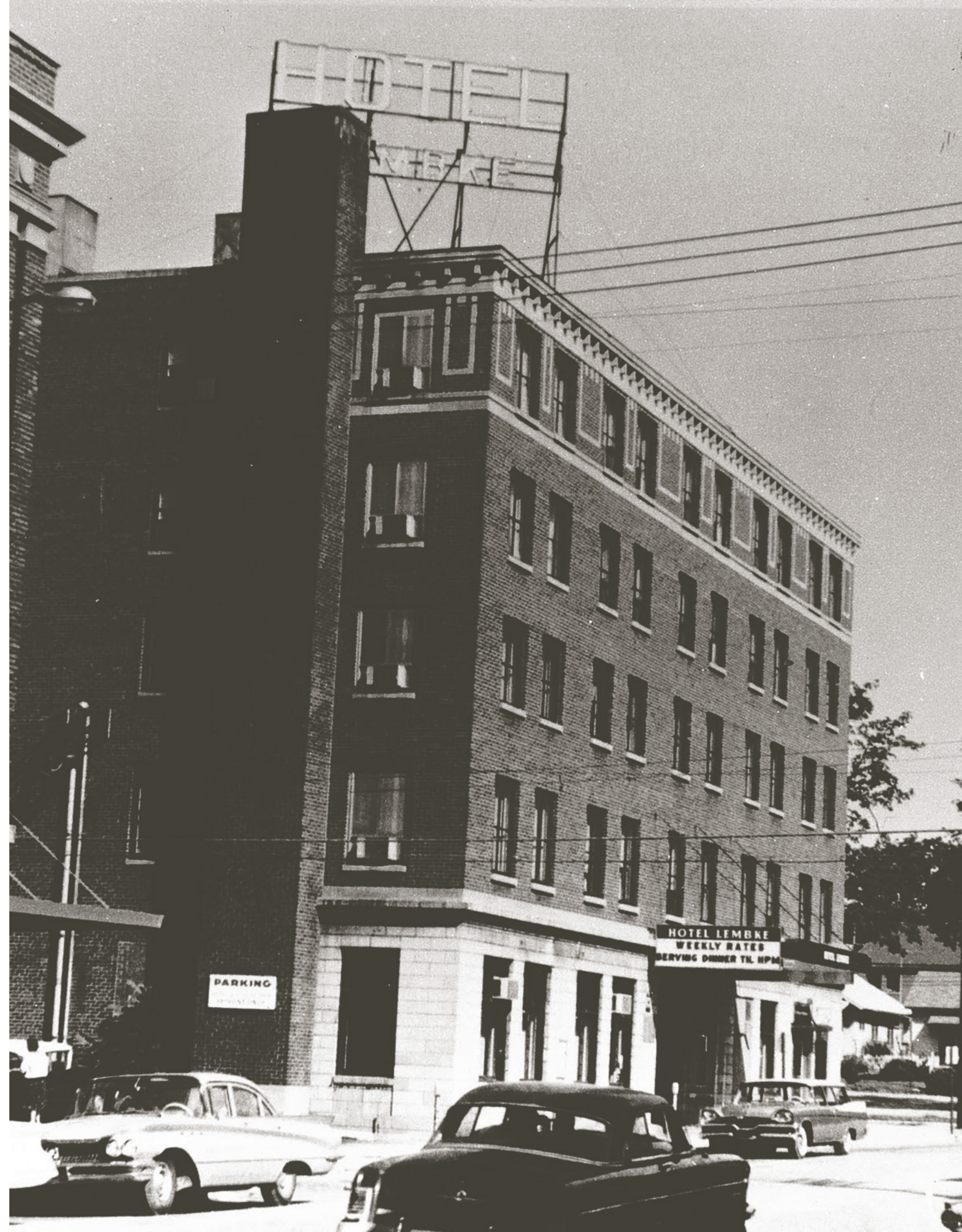
Right The Hotel Lembke seen from the southeast, circa 1950s