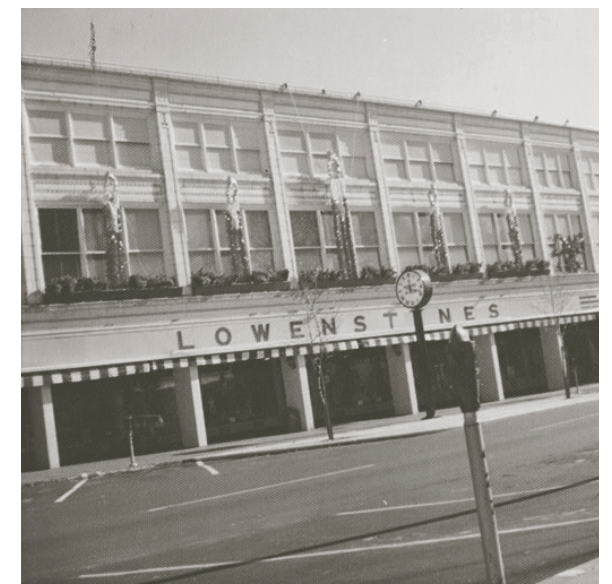
9. Lowenstine Department Store Built circa 1916, burned in 1996