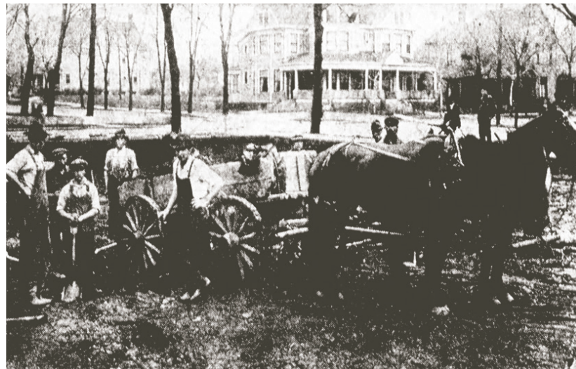
Hotel Lembke Construction begins on the southwest corner of the intersection of Jefferson and Lafayette Streets, circa 1919

too soon, his energy failed again, and he died July 18, 1923. His official cause of death is listed as fiber neuritis, with lack of sleep and exhaustion as contributing factors.