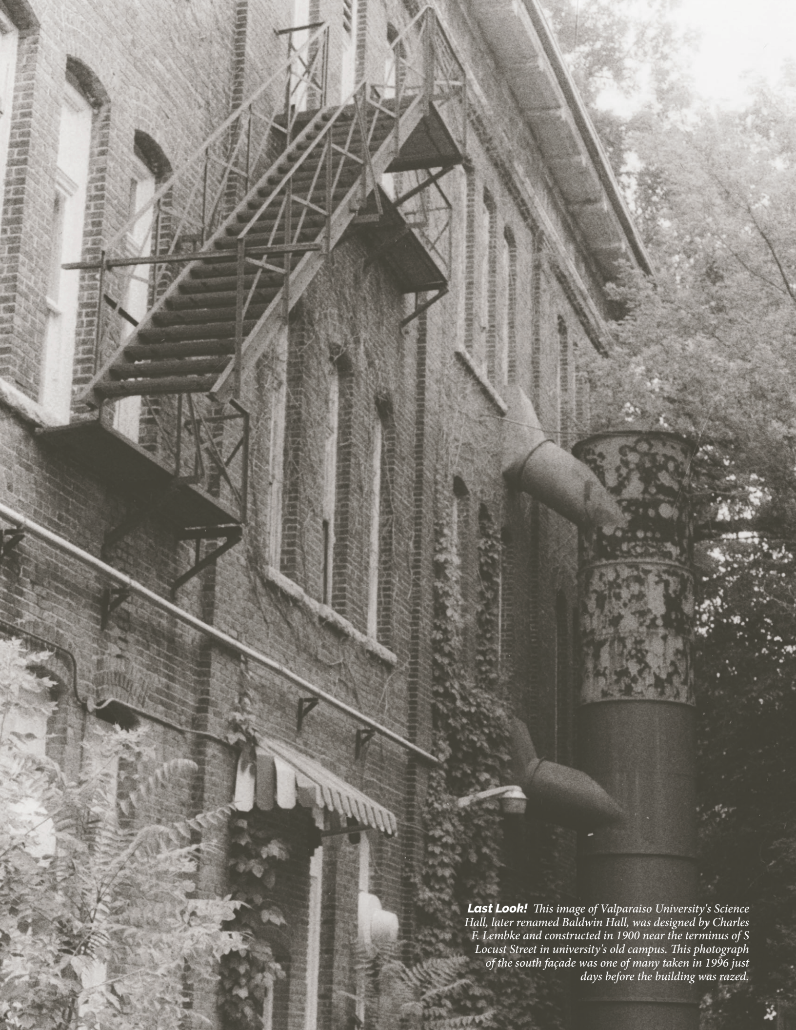
Last Look! This image of Valparaiso University's Science Hall, later renamed Baldwin Hall, was designed by Charles F. Lembke and constructed in 1900 near the terminus of S Locust Street in university's old campus. This photograph of the south façade was one of many taken in 1996 just days before the building was razed.