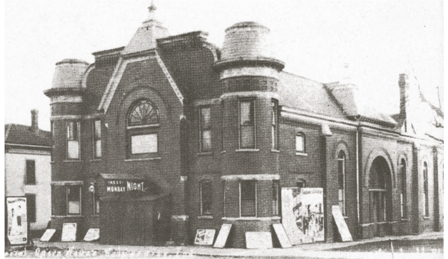
2. Memorial Hall (Memorial Opera House) • Built in 1893