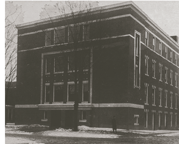
4. Agriculture and Domestic Science Building (DeMotte Hall) Built circa 1893, razed in 1996