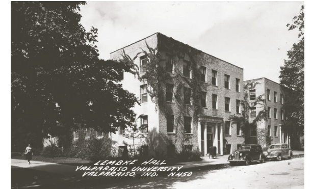
7. Lembke Hall Built circa 1906, razed in 1987

9 Lembke designed the third Lowenstine Department Store, which was constructed between 1914 and