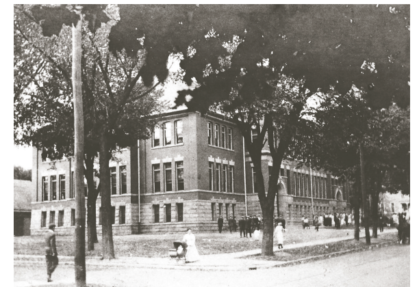
8. Central School Built circa 1904, burned in 1938