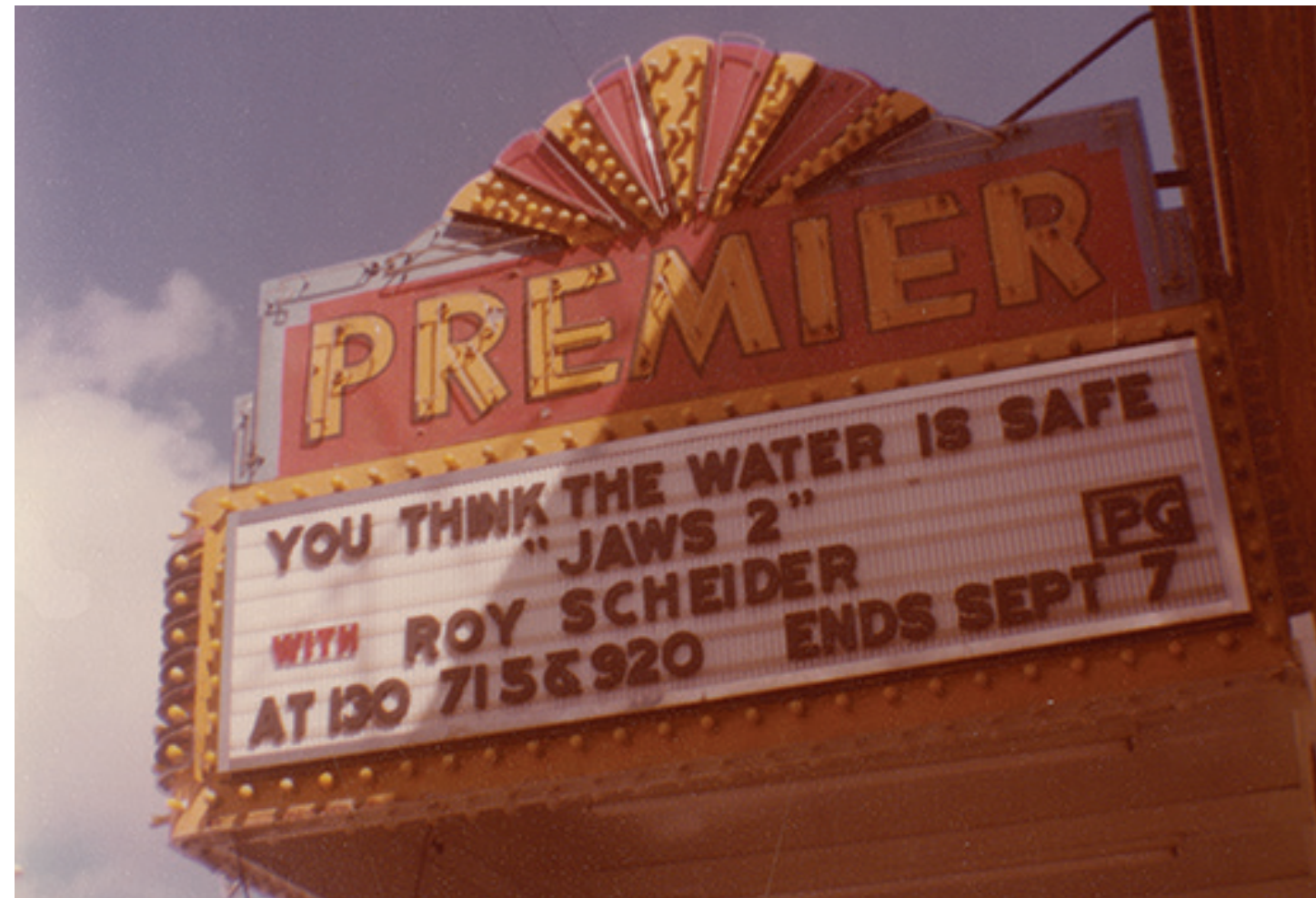
Premier Marquee This photograph from 1978 captures the marquee advertising a film from that summer, Jaws 2 . Notice the paraphrase of the famous and oft-parodied tagline from the film, “Just when you thought it was safe to go back in the water.”