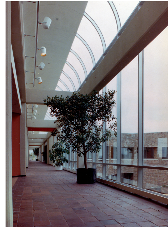
Southlake Community Mental Health Center Merrillville, Indiana, circa 1977

The firm took all the work it could get, designing projects ranging from private residences to the club house of the Forest Park Golf Course. Their work on a small commercial building of the Hudson Insurance Company in Valparaiso earned them an award from the American Institute of Architects.