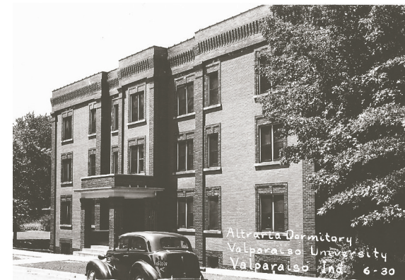
6. Altruria Hall Built in 1908, razed in 1985