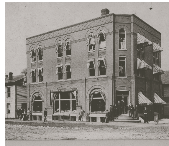
5. Bogarte Hall Built circa 1892, razed in 1988