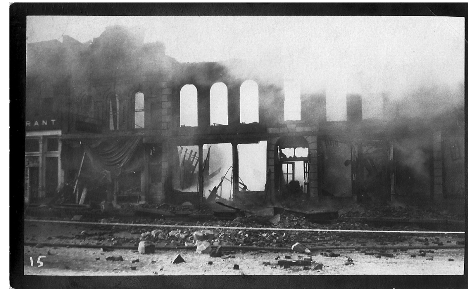
Above • Aftermath of the Academy of Music Block fire showing the building's South Washington Street façade, 1926.