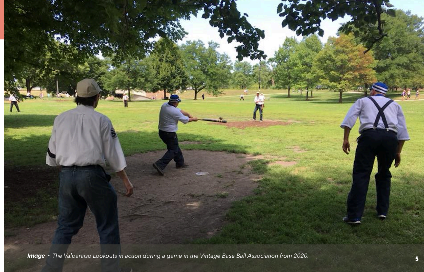
Image • The Valparaiso Lookouts in action during a game in the Vintage Base Ball Association from 2020.