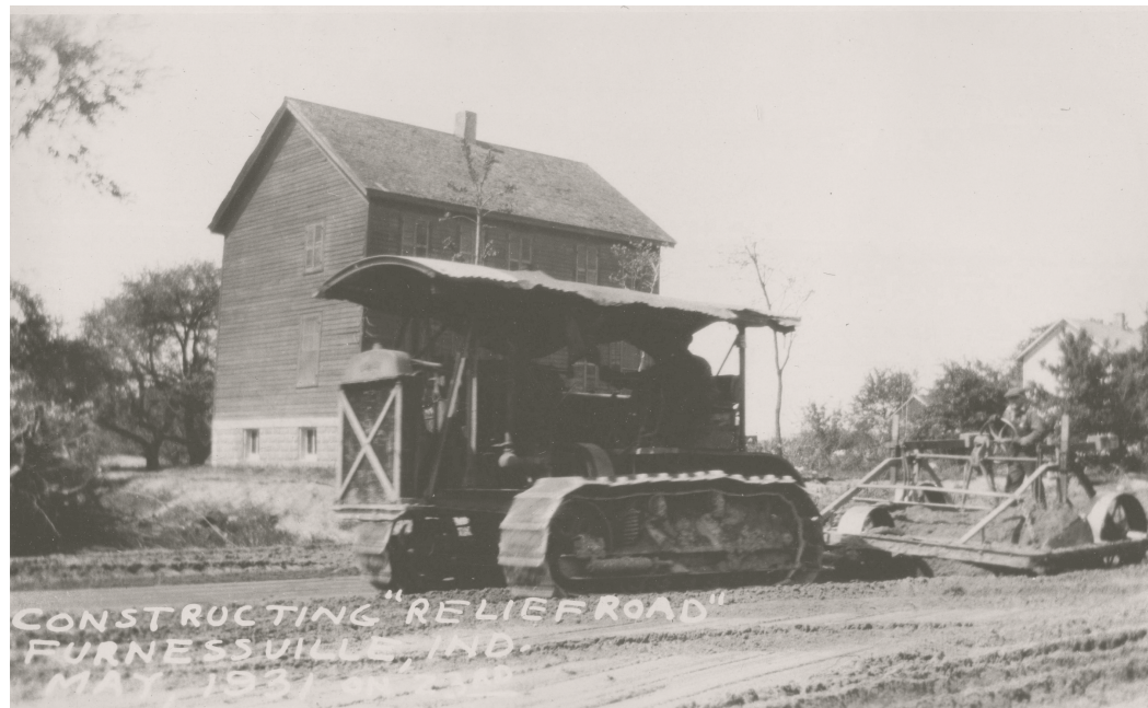
Above • An image of the “relief road” being constructed through Furnessville. May 1931. Right • The Williams’ Homestead before its relocation during the construction. May 4, 1930.